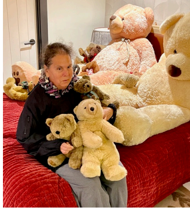
Diamond cuddling up with the teddy bear family.