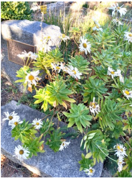
Fall flowers