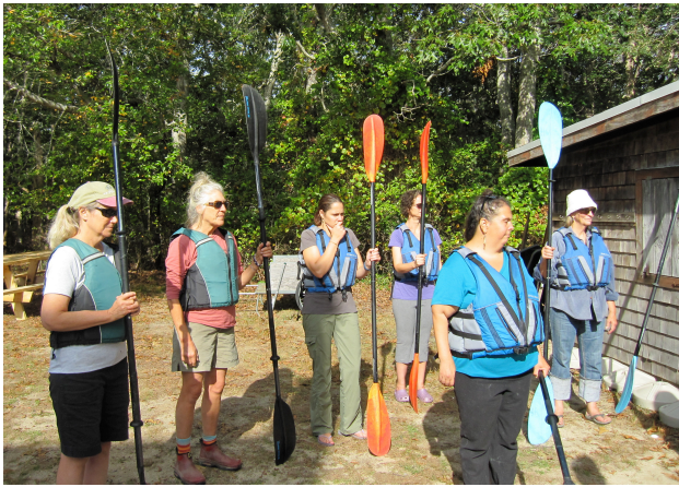
Getting our instructions